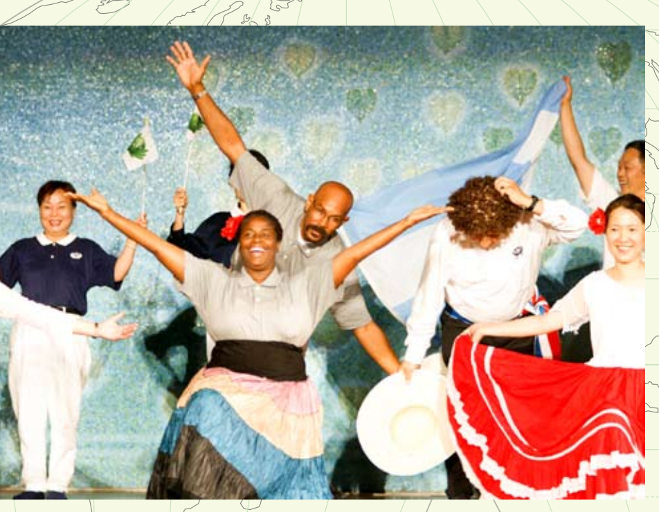
Member from Paraguay and Argentina dancing and singing on the Festivity Day of the Mid-Autumn Festivital.