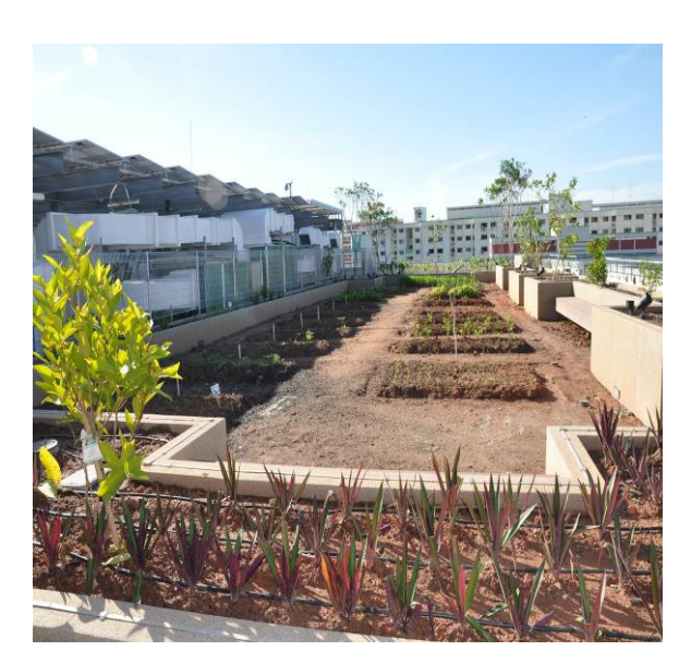
Alexandra Health Cluster- Hospital's gardens

Healthy eating is promoted throughout the hospital – from wards to eateries. Fresh fruits and vegetables are harvested from hospital's gardens and served to patients in the wards. In the food court, food stalls and café serve healthy yet delicious food, prepared with less oil, salt and sugar. To further encourage healthy eating, the food is not only healthier, but also cost less than restaurant food.