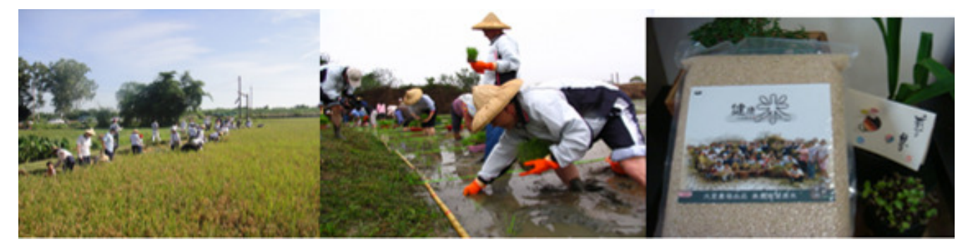
Buddhist Dalin Tzu Chi General Hospital- In the Da Ai Farm, staffs and families harvest together and rice with their own brand.

As a Buddhist hospital, providing vegetarian food is mandatory and the most important and effective action on easing the burden of global warming. The Da Ai Farm is a farm within the hospital compound where it serves local and organic produce in the hospital's cafeteria. By doing so, it reduces carbon dioxide emissions from transporting process. It also serves as horticultural therapy for the mentally-challenged. Besides being friendly to the environment, vegetarian diets have been proved to be healthy for people.