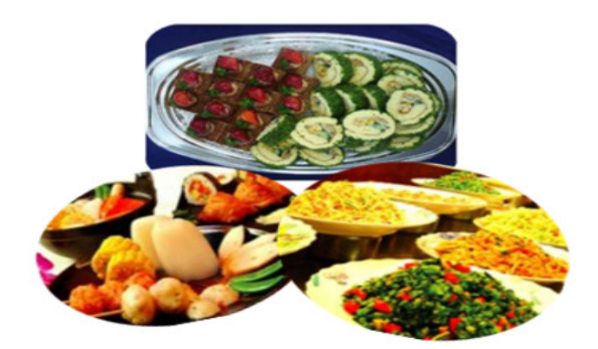
Buddhist Taipei Tzu Chi General Hospital- The Da Ai Food Court provides a variety of vegetarian diets.

In Da Ai Food Court, there are different styles of vegetarian diets. The nutrition labels sign, summarized by the dieticians are placed are placed in the food court entrance to give people the idea of different meals in different stands.