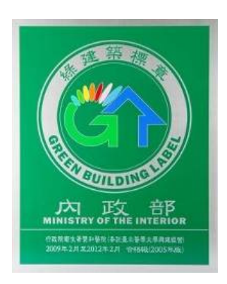
Shuang Ho Hospital- Green Label Building