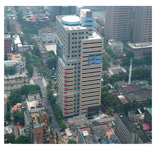
National Taiwan University Hospital, Children and Women Building

outpatient department, examination room, operation room, intensive care unit, general wards, bone marrow transplantation wards, laboratory and logistics support etc. The complexity of the facilities ensures full operational support in providing medical services.