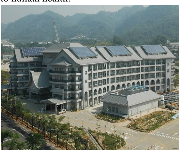
Buddhist Taichung Tzu Chi General Hospital-Photovoltaic system

While facing the crisis of energy environmental problem, shortage and government and non-governmental organizations have made more efforts in saving energy and reducing carbon footprints. Taiwanese Government popularized the photovoltaic systems nationwide in 2002, and offers 50% subsidy for private organization and households using photovoltaic systems. However, most people think that the photovoltaic system is too expensive, and the cost of generating electric power is high, making it difficult to be widely accepted. In fact, we import about 98% of energy source from other countries; therefore, we cannot afford to use too much energy. From the environment protection point of view, traditional ways of power generation include using coal, petroleum or firepower that would produce carbon dioxide, increase global warming, and pose a threat to human health.